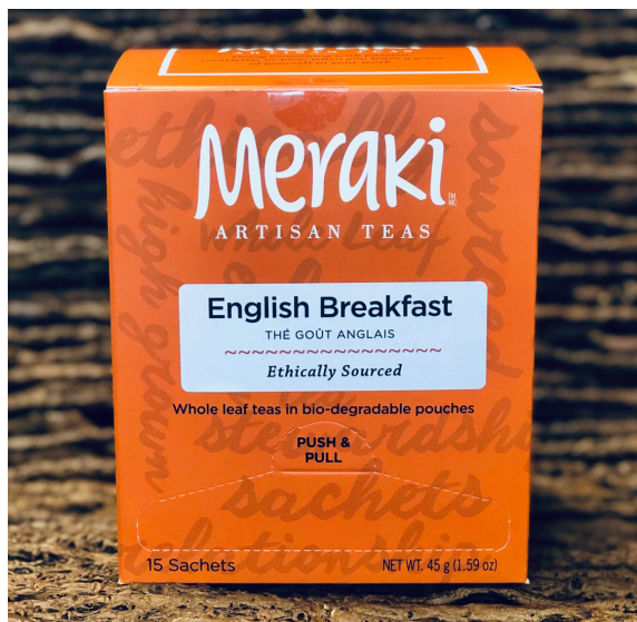
Black Tea - Caffeinated

This quintessentially British tea is the most recognized flavoured tea in the world! High-quality black tea leaves are infused with citrusy oil of Bergamot and laced with blue corn petals that will give this tea its distinct aroma.