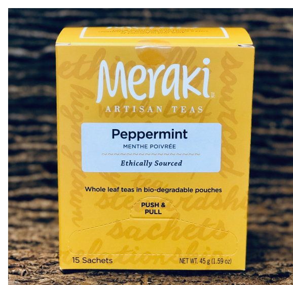
Herbal Tea - Decaffeinated

African Rooibos passionately blended with Lavender flowers, Rose petals, and berries, creating a tart and floral tea. This calming and relaxing tea blend is loaded with antioxidants and can be served hot or iced.