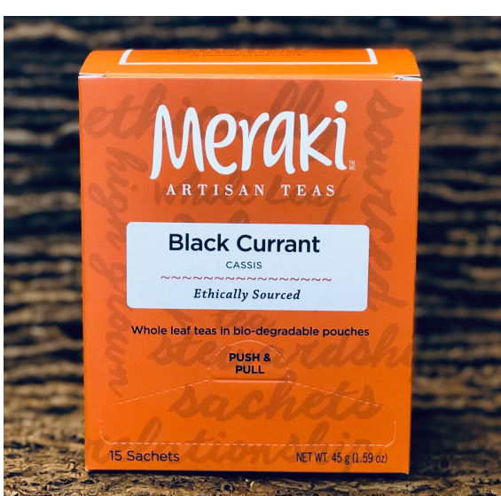
Black Tea - Caffeinated

High-quality Assam estate teas with a full body, malty sweet flavour with notes of honey. Great with milk!