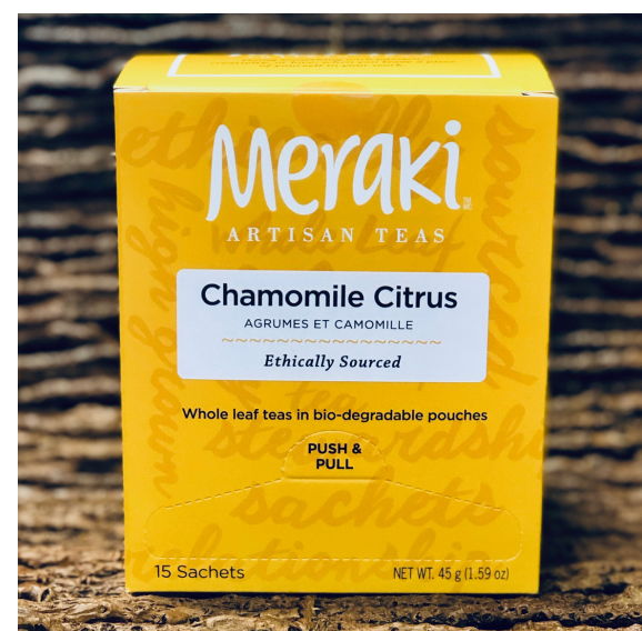
Herbal Tea - Decaffeinated

A beautiful blend of berries and Hibiscus petals, creating a sweet and tart herbal fruit tea. This refreshing and vibrant tea may be served hot or iced.