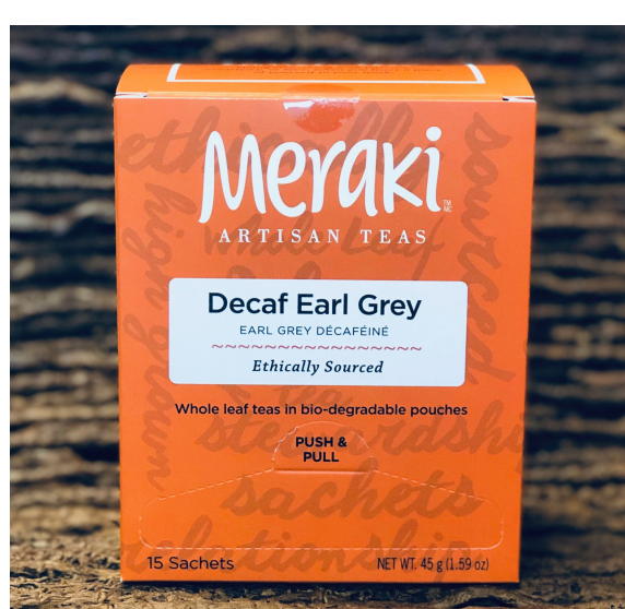
Black Tea - Decaffeinated

Premium black tea infused with intoxicating aroma, and sweet and tangy flavour of black currants. Great served hot or iced!