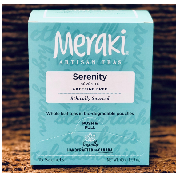
Wellness Tea - Caffeine Free

This energizing and robust blend is formulated to help your mind and body to go the distance. The green mate will provide you with the boost you need while the green tea and matcha powder will sharpen your mental focus. The lemongrass and spearmint will add a refreshing taste to this blend.