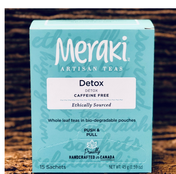
Wellness Tea - Caffeine Free

This blend is formulated to aid in digestion. Ginger root paired with peppermint are the two pillars of this blend, and along with dandelion leaves, cardamom, and licorice root will soothe your stomach in no time.