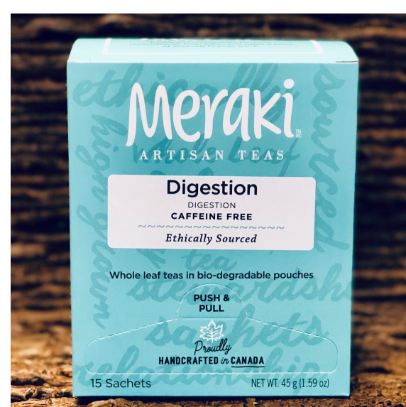
Wellness Tea - Caffeine Free

This blend is formulated to supply antioxidants and help to reduce free radicals. The combination of rooibos, green tea and matcha powder will supply naturally potent antioxidants. Blueberry, elderberry, and lavender will add a fruity taste and fragrant aroma to this rejuvenating tea.