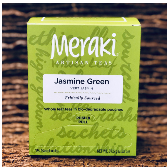
Green Tea - Low Caffeine

Japan's most popular, highly prized green tea blended with refreshing and cool spearmint and peppermint leaves with a hint of lemon.