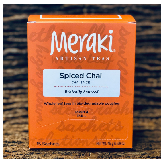
Black Tea - Caffeinated

This classic tea is rich and full-bodied with a bright finish. Perfect with or without milk and sweetener. Great as an all day tea.