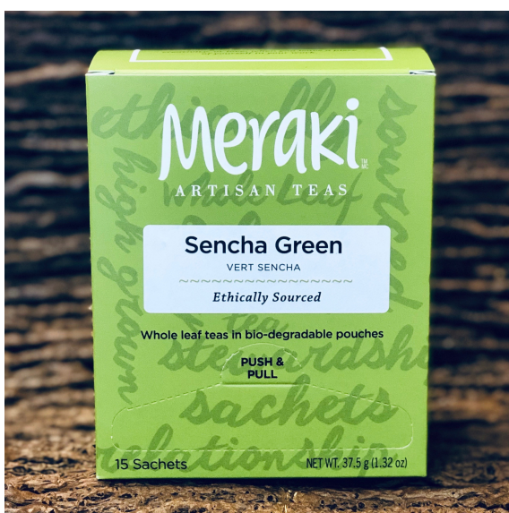
Green Tea - Low Caffeine

Most famous of all scented teas! Small batch handcrafted green tea is combined with jasmine blossoms to create a tea with intoxicating and perfumed aromas, and delicate flavour