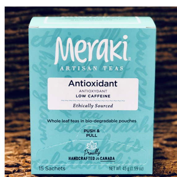
Wellness Tea - Low Caffeine

This blend is formulated to maintain immunity and overall health. Ginger and turmeric are known to support healthy joints and immune function, while echinacea will promote the anti-inflammatory, antioxidant, and antiviral properties.