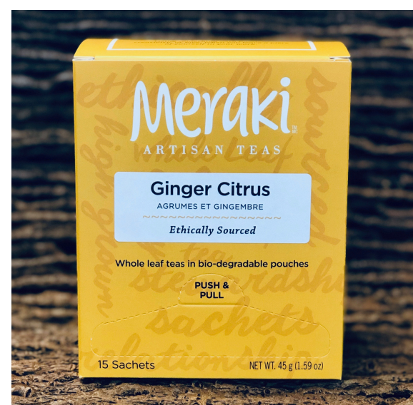
Herbal Tea - Decaffeinated

This Willamette Valley-grown peppermint tea will awaken the senses, and sooth the soul. Cool, refreshing and crisp with an incredible aroma. Simply delicious.