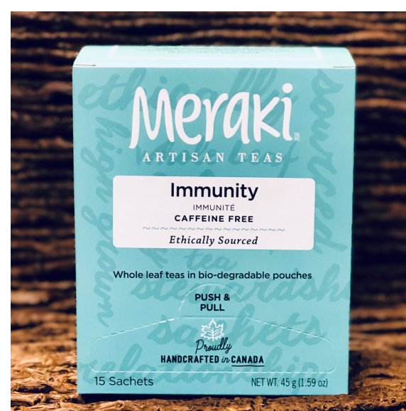
Wellness Tea - Caffeine Free

This blend is formulated to calm the mind, soothe the nerves, and promote relaxation and good sleep. Peppermint and chamomile will soothe and relax while the passionflower and the valerian root will reduce tension and stress. Combined together they are sure to relax mind and body.