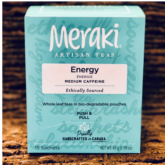
Wellness Tea - Medium Caffeine