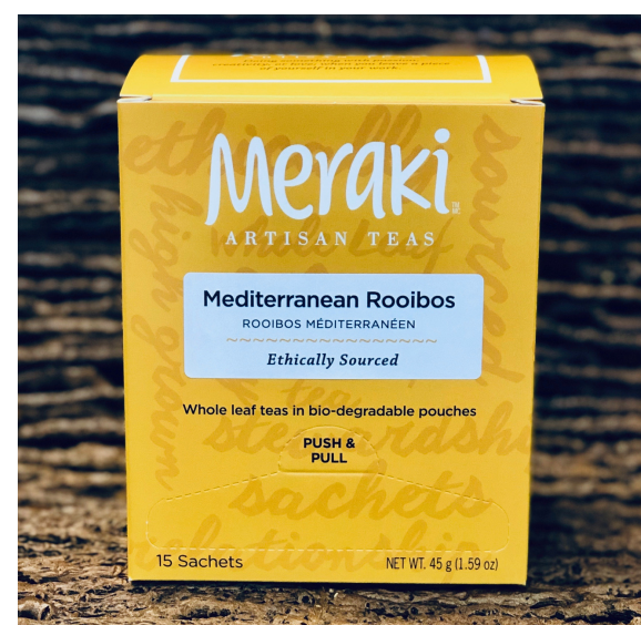
Herbal Tea - Decaffeinated

The finest Egyptian chamomile flowers, from the banks of the Nile, are the base for this artisan tea blend. Refreshingly sweet with citrus and floral notes, this tea will relax and calm the senses.