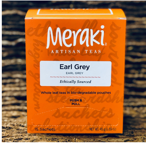
Black Tea - Caffeinated