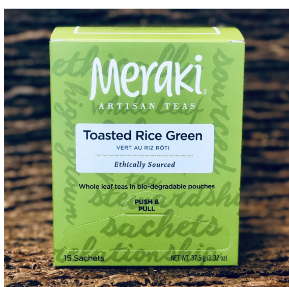
Green Tea - Low Caffeine

A beautiful combination of green tea with captivating sweet tropical flavours, and exotic passion fruit notes. Excellent served hot or iced.