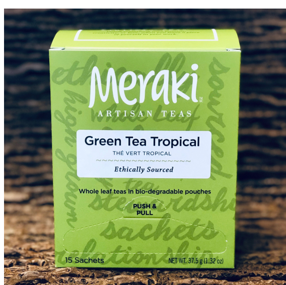
Green Tea - Low Caffeine

Sencha is Japan's most popular, highly prized green tea. The large leaves produce a delicate sweet flavour and are very aromatic.