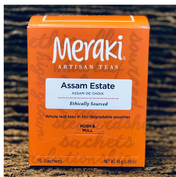
Black Tea - Caffeinated

Exotic spices expertly blended with high-quality black tea to create this invigorating fragrant balance of smooth and spicy.