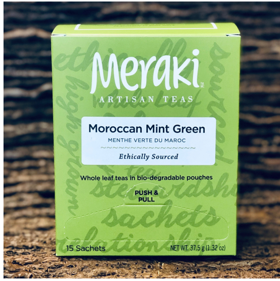
Green Tea - Low Caffeine