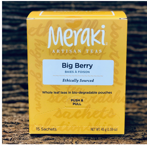
Herbal Tea - Decaffeinated